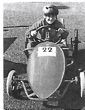
INVERLOCH BILLYCART DERBY 2006 (Organised by the Clocktower Committee)

fashions, competitions, partying and the like. It is about people doing all the things they like to do, and of the numerous community groups who aim to contribute to their community thereby making Inverloch a better and happier place.