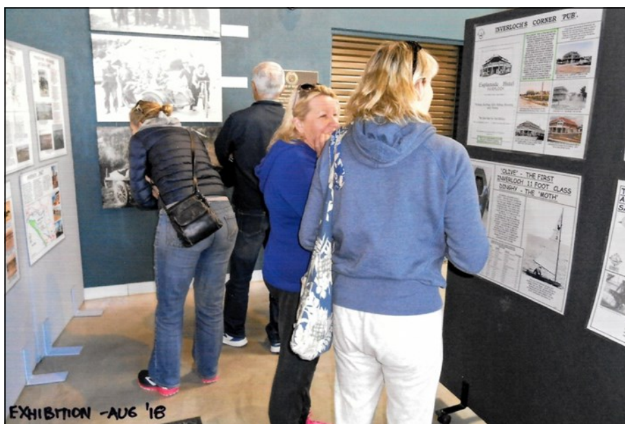
ABOVE: Visitors enjoying the Society's 2018 Annual Exhibition staged at The Hub, A'Beckett Street Inverloch during August.

The Foreshore Committee's reference to "supplies of wood and