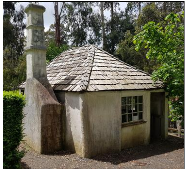
ABOVE: Wattle & daub cottage with shingle roof (1842) from Middle Tarwin, the oldest building in Gippsland.

Notwithstanding these difficulties, Coal Creek operates a vibrant schools program along with very popular and successful Halloween Nights and Ghost Tours, all of which return funds to help with the