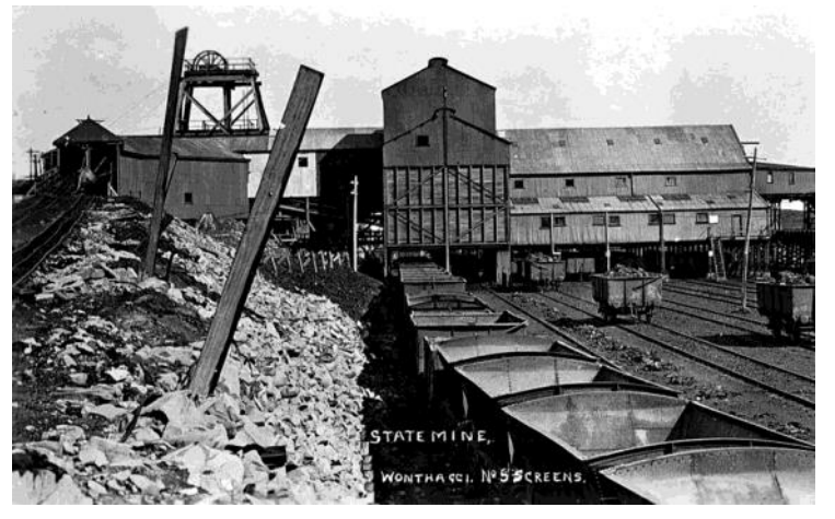
Railway trucks waiting at coal transfer station, Wonthaggi Coal Mine

The Society was able to donate almost $40 to the work of the volunteers.