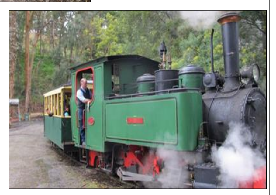
ABOVE: Coal Creek's Count Strzeleckie Steam Train.

We encourage you to bring along your camera and enthusiasm for a great night!