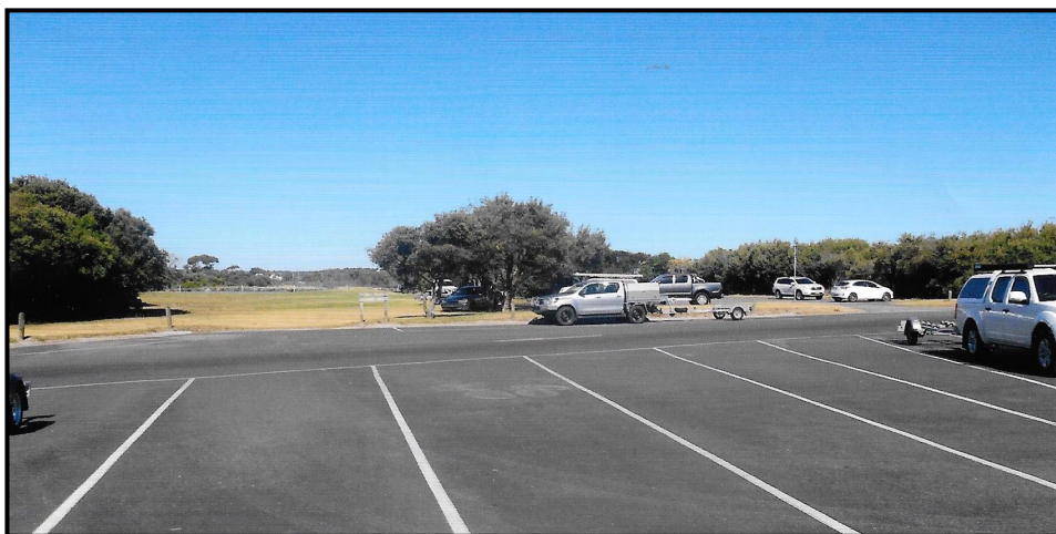
Left: Vacant Crown Land adjacent to the jetty car & boat parking area on The Esplanade. The area is currently available for overflow parking during peak periods.

Our forefathers were hardy souls, many of stern demeanour and above all, men and women of vision and endurance. Inverloch survived the early years due, in part, to the mariners who served aboard coastal trading vessels such as Ripple , Manawatu and Despatch , delivering vital supplies through many storms.