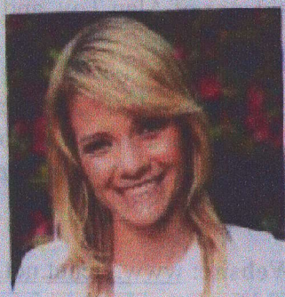
JESSICA WATSON OAM INVERLOCH CLASSIC WOODEN DINGHY REGATTA AMBASSADOR