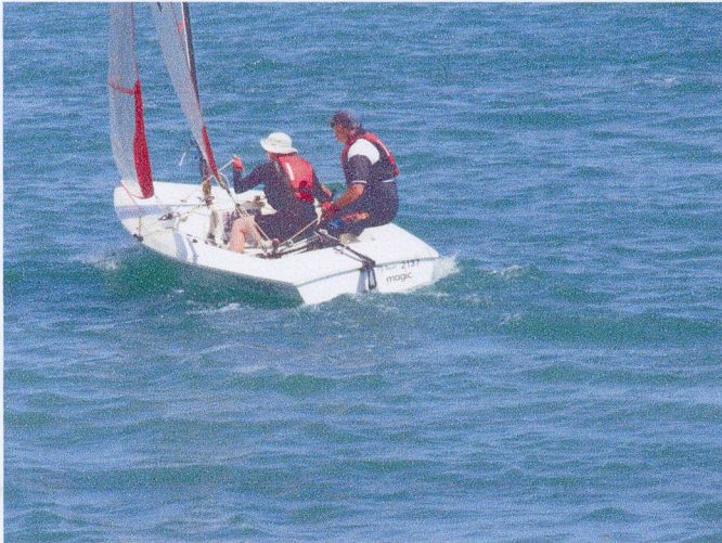
Yacht race in progress on the Inlet.

Caravan Park. Moller's Caravan Park has now closed to make way for a housing development near the foreshore at Inverloch. The sign above the entrance gate is still standing, however it has been acquired for the Historical society to show to future generations. We look forward to the time when we have a place where we can display the many other items collected over the nearly 19 years since the I.H.S. began in the town.