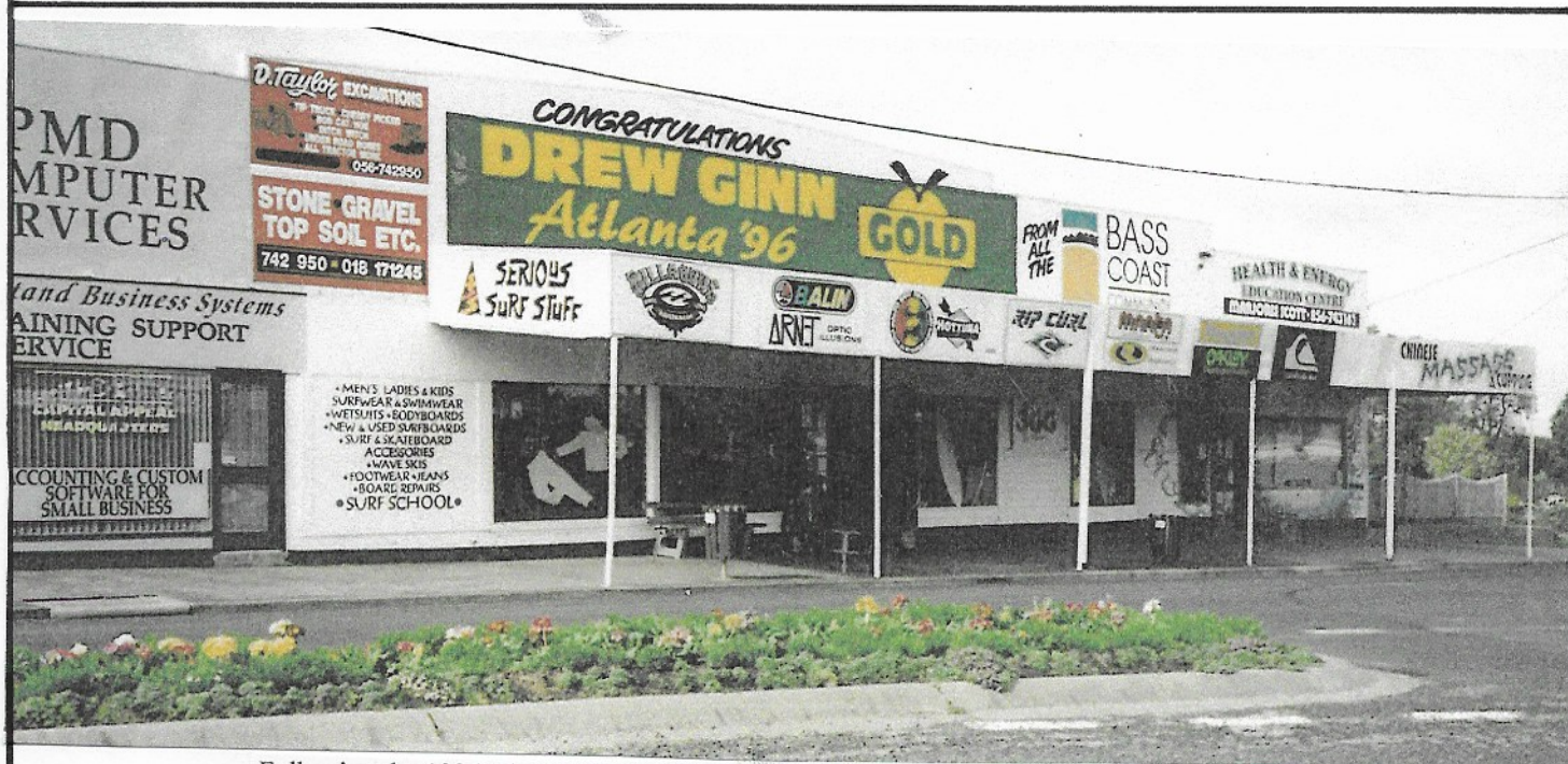
Following the 1996 Olympics at which Inverloch's Drew Ginn won gold, the Bill Ramsey building of the 1930's, was painted up suitably to celebrate his victory and town visit. The building has had many frontal changes, registering the many business usages it has undergone.