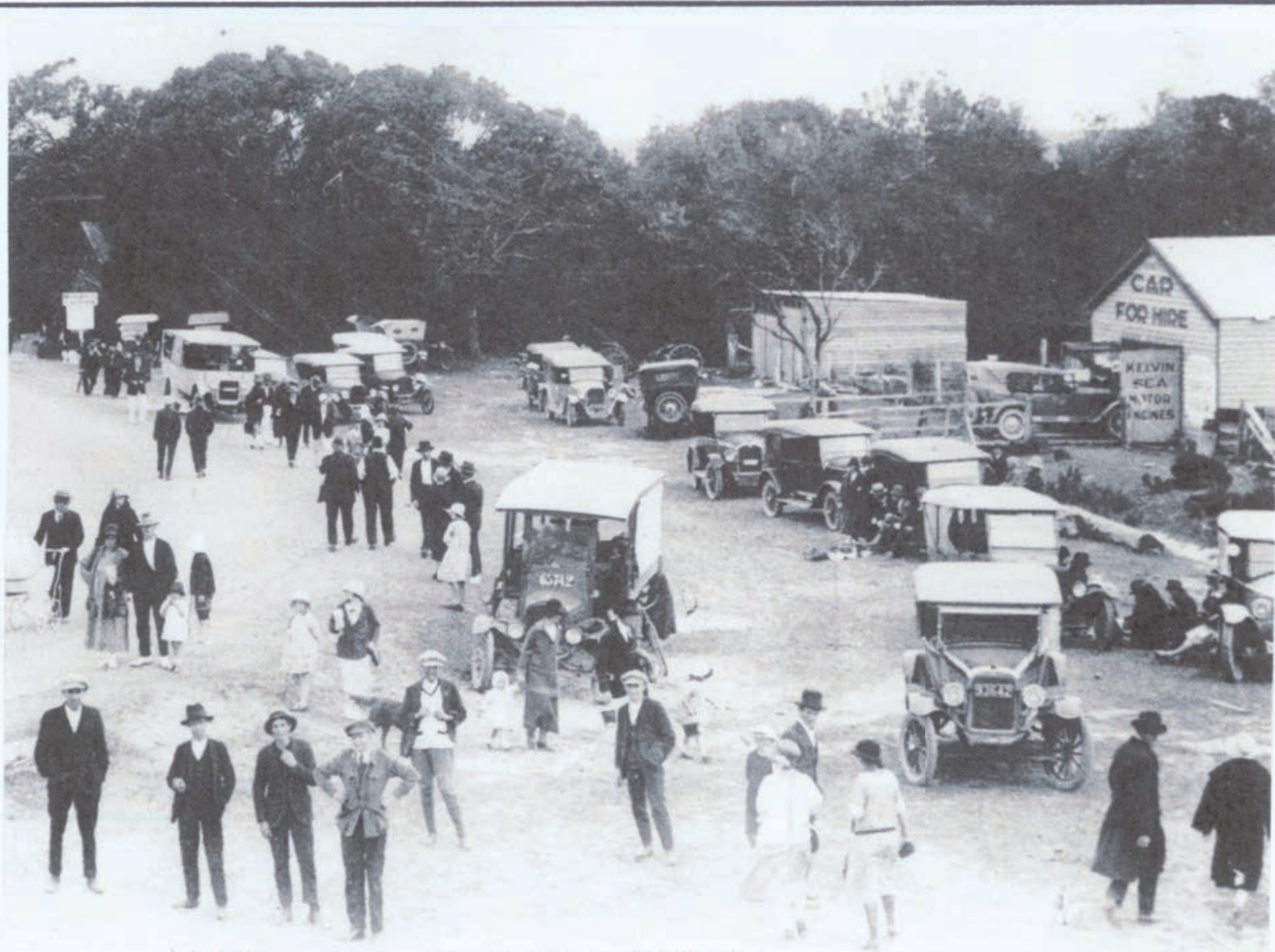
A holiday gathering at Inverloch in the 1930's. The treed area is now the Glade!