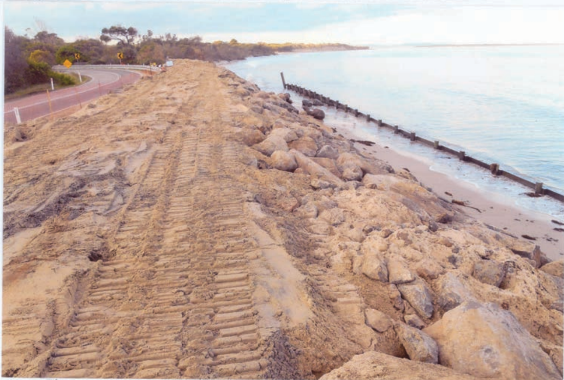
The new retaining wall recently erected where Toorak Rd. meets the Cape Paterson Rd. Note the original barrier created twelve months beforehand.

We've had a welcome response from many old members. I would urge everybody to continue their membership. It is hoped our General Meetings will resume in early 2021.