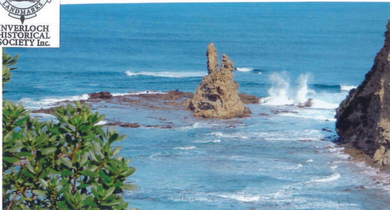
Eagles Nest in Summer 2018. A fragile, natural structure, its beauty remains.