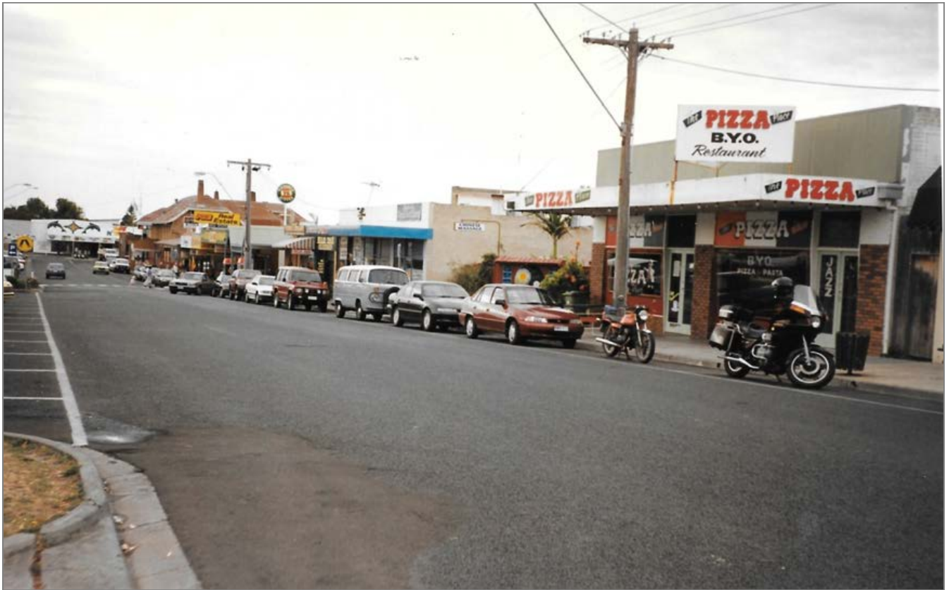
ABOVE: A'Beckett Street c.1996.

Notice how much Inverloch's shopping area has changed. The Esplanade Hotel & Ramsey's building at the far end still remain.