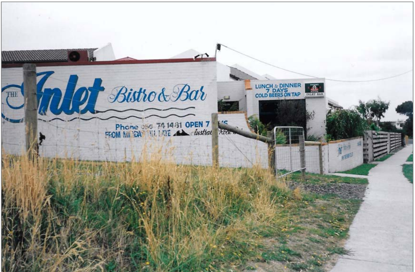
ABOVE: Sitting opposite The Glade, the original Inlet Bistro and Bar. Part of the restaurant was retained in the new Inlet Hotel

Notice how much Inverloch's shopping area has changed. The Esplanade Hotel & Ramsey's building at the far end still remain.