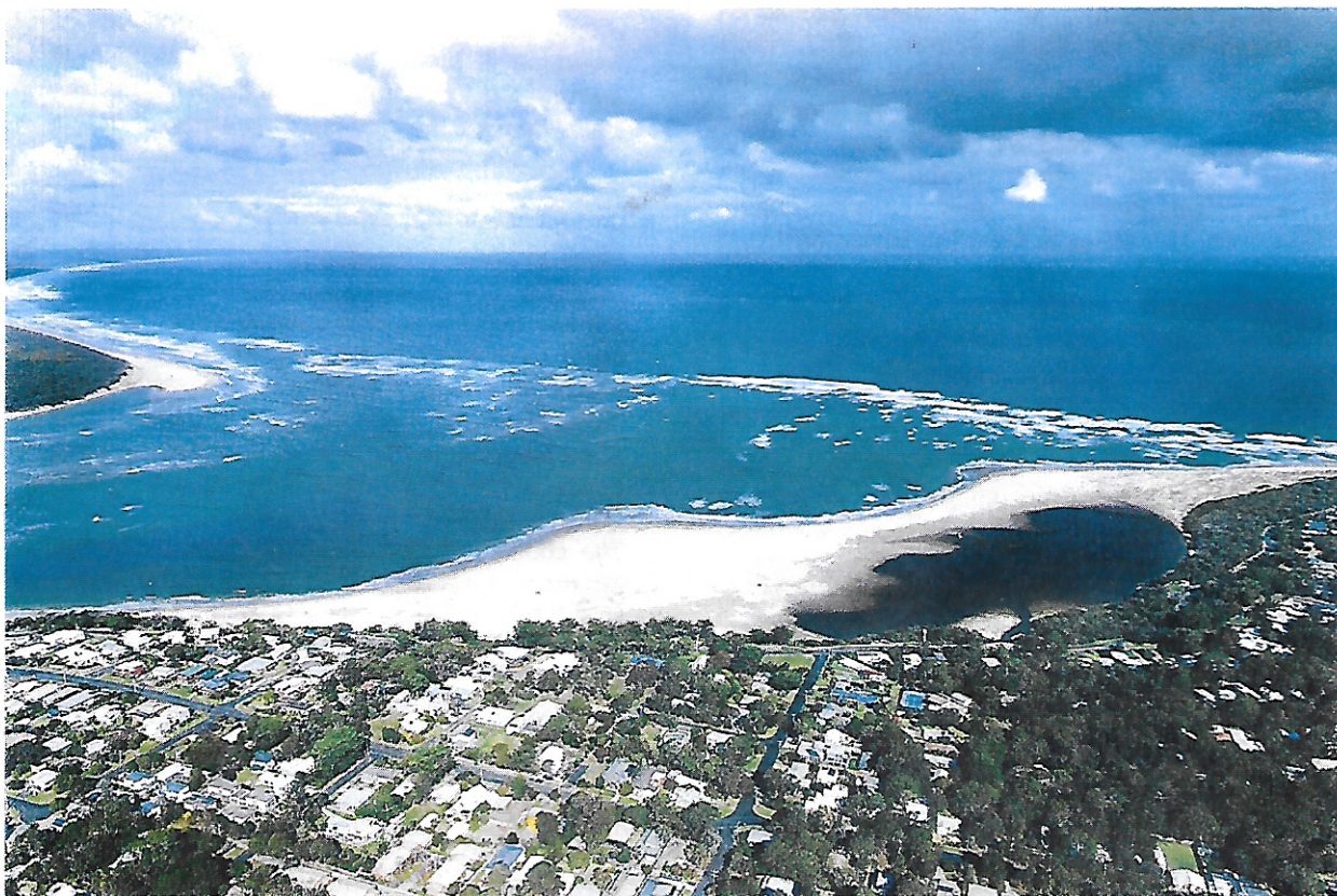
Inverloch, showing the difficult conditions to enter the Anderson Inlet Harbour. Note the newly formed 'lagoon' fronting Abbott St. 2018

Our first General Meeting for 2020 will be held on Wednesday 26th. February at 2pm. at the RSL Hall in Inverloch.