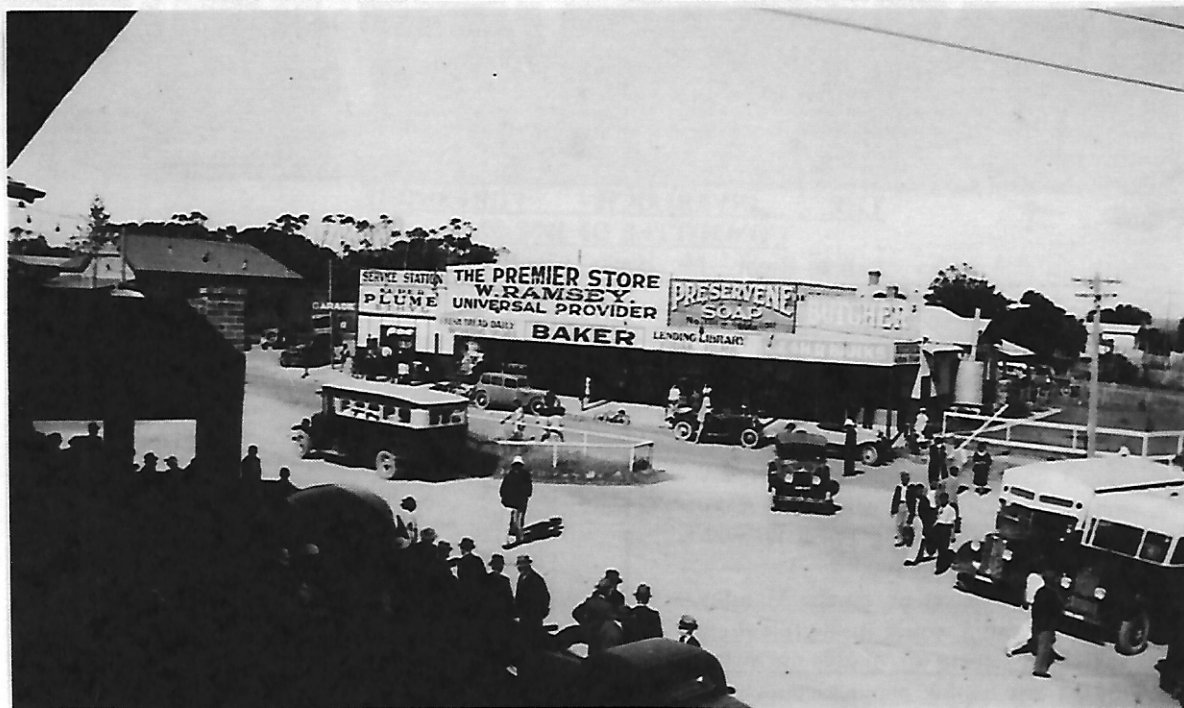
A 1933 photo of the new RAMSEY'S GENERAL STORE which included a bakery, delicatessen, farm supplies, petrol, oil, garage and estate agent. The butcher's shop opened by the Banks brothers is far right.