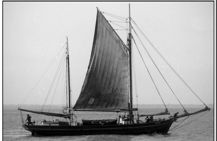
Ripple (above, and more recently, below), a 17-meter sailing ketch built in 1872 provided a monthly service carrying supplies and passengers from Melbourne calling at Inverloch, Maher's Landing and Tarwin Lower. Ripple's visits declined, following the draining of the Koo-Wee-Rup swamp and the opening of a road from Melbourne.

Work will commence on 1 November 2017 and continue until the end of February 2018. During this time, the area around the Ripple (located in central Inverloch) will officially become a secure worksite, complete with fencing. This may present difficulties to the Society if we need access to the Rocket and work shed. Stay tuned members, by visiting the site!