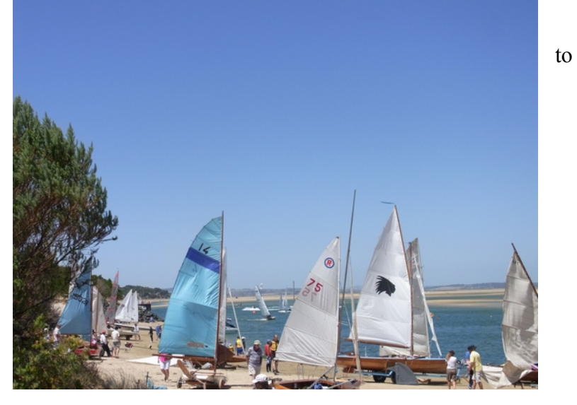
Yachts at the Inverloch Classic Dinghy Regatta.